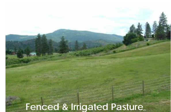
Fenced & Irrigated Pasture