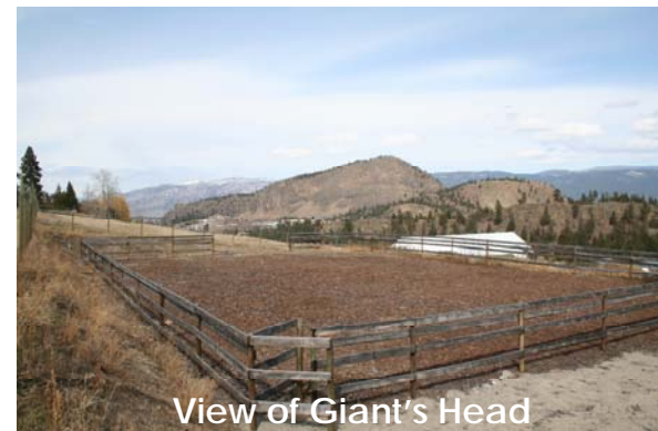
View of Giant's Head